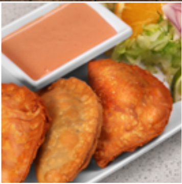
Empanadas De Camarón