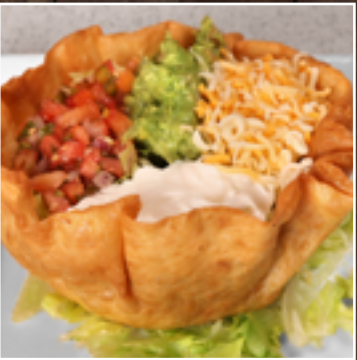
Taco Salad Bowl

Mix greens, tomato, red onions, asparagus & grilled salmon