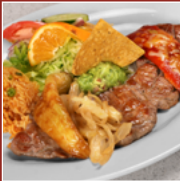
Carne Asada A La Tampiqueña