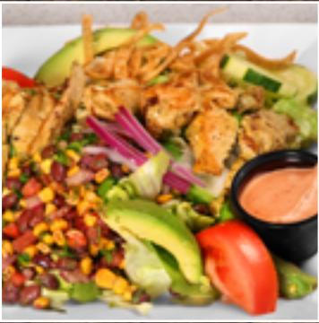
Southwest Chicken Salad