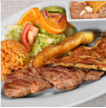
Cielo Y Tierra Combination

Grilled Chicken Breast Served with vegetables and rice (8 oz) 14 95